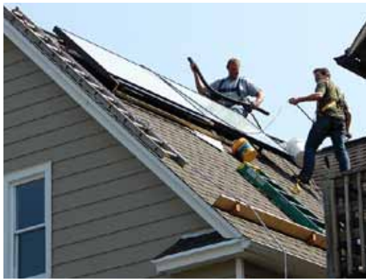
SOLAR PANEL INSTALLATION ON TURNKEY HOME