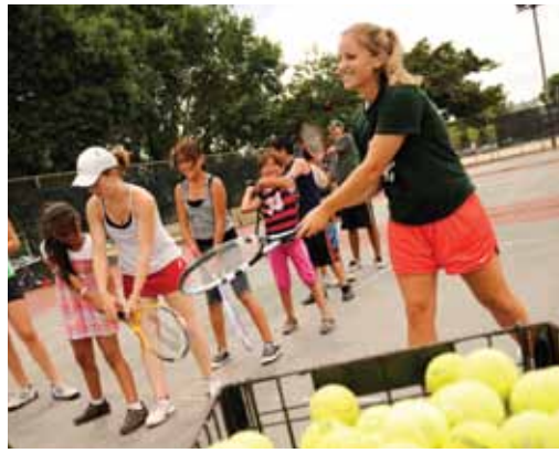
TENNIS LESSONS IN BURNHAM PARK