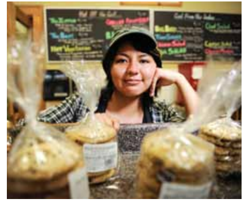
WILD FLOUR BAKERY