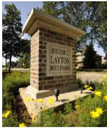
HISTORIC LAYTON BOULEVARD MONUMENT