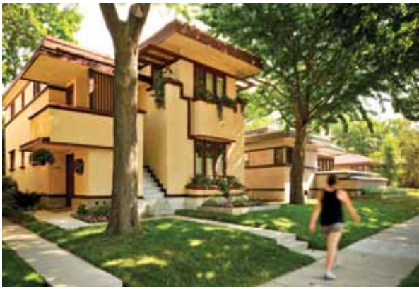
HOMES ON BURNHAM STREET DESIGNED BY FRANK LLOYD WRIGHT