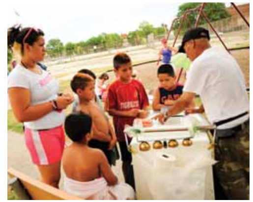
ICE CREAM VENDOR IN BURNHAM PARK