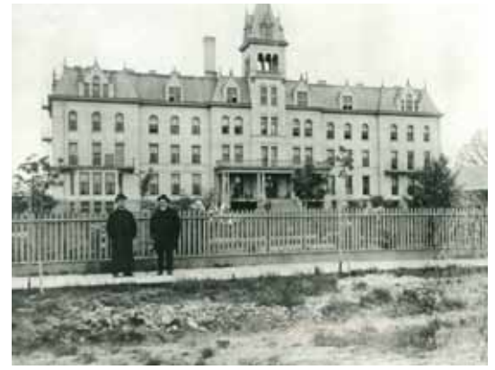
SACRED HEART SANATORIUM ON LAYTON BOULEVARD – 1893*