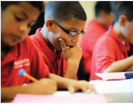
NATIVITY JESUIT MIDDLE SCHOOL