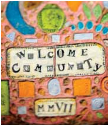
WELCOME TO OUR COMMUNITY!