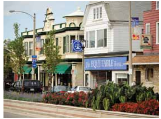
NATIONAL AVENUE STREETSCAPING