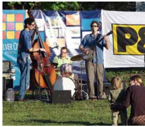
SOUNDS OF SUMMER CONCERT IN ARLINGTON HEIGHTS PARK