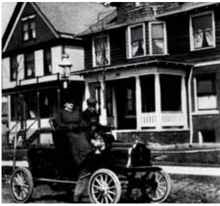
LAYTON BOULEVARD – 1906*