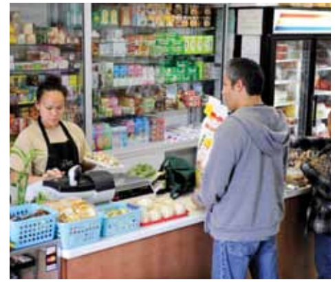
ASIAN INTERNATIONAL MARKET

LBWN and partners will work to improve green spaces and promote the use of the Hank Aaron State Trail among residents. We will continue to promote biking, running, walking, and other exercise; advocate for the creation of local sports leagues; and connect residents with existing recreational outdoor and indoor spaces for year-round use.