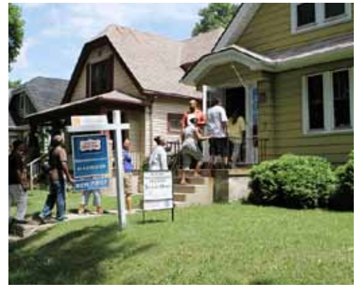
HOME OWNERSHIP PROMOTION ACTIVITIES