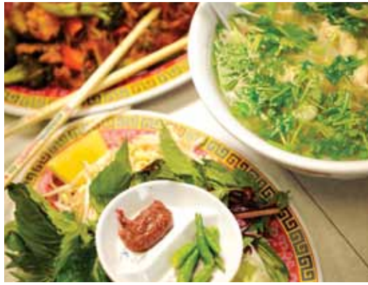
VIENTIANE NOODLE SHOP