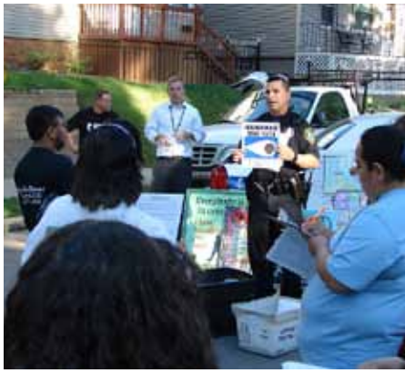
BLOCK GROUP MEETING