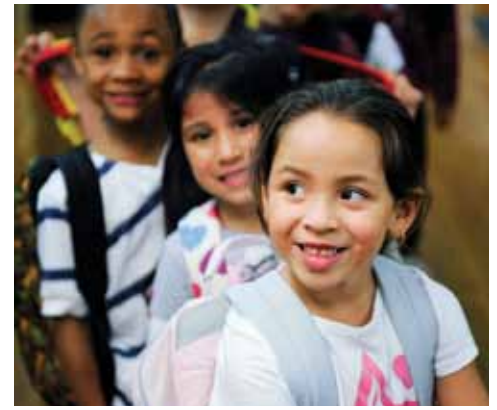
U.S. GRANT SCHOOL