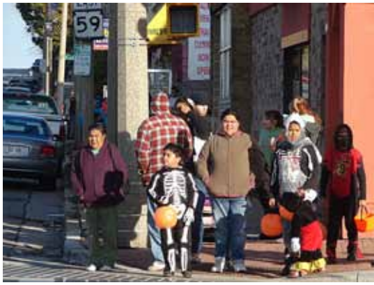
TRICK OR TREAT STREET ON NATIONAL AVENUE