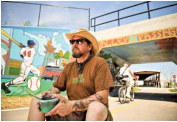
HANK AARON STATE TRAIL ARTIST