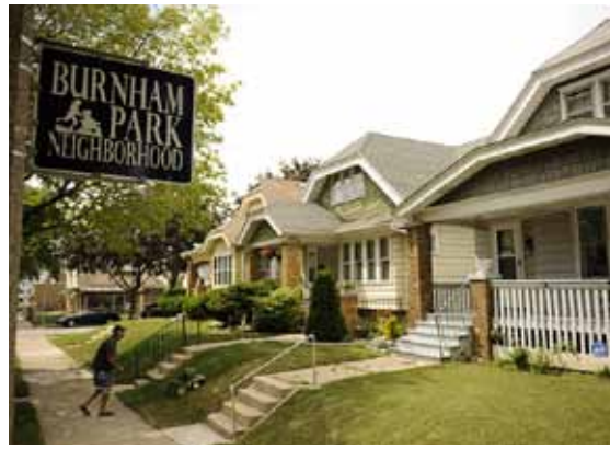
BURNHAM PARK NEIGHBORHOOD