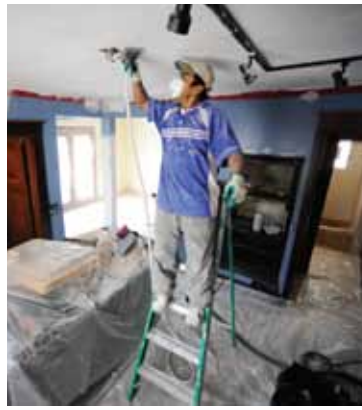
TURNKEY RENOVATION PROGRAM