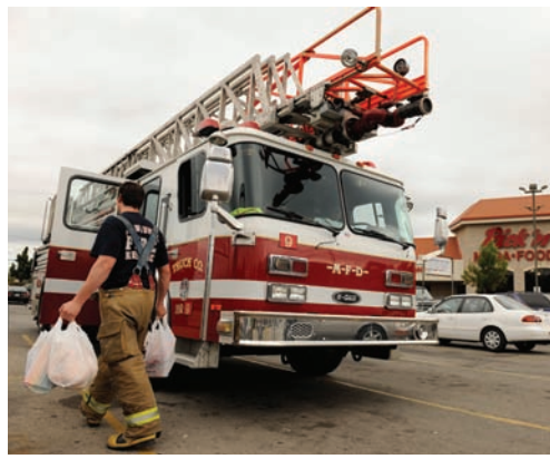
FIREMEN AT THE PICK'N SAVE