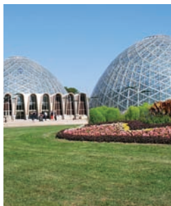
MITCHELL PARK DOMES