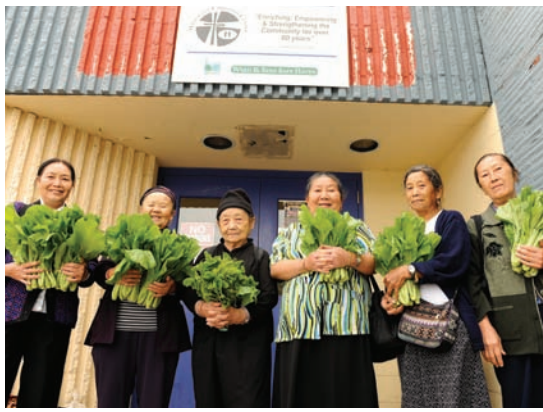
MILWAUKEE CHRISTIAN CENTER