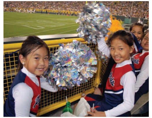
ORGANIZED YOUTH SPORTS PROGRAMS