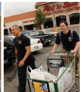
CESAR CHAVEZ DRIVE & NATIONAL AVENUE