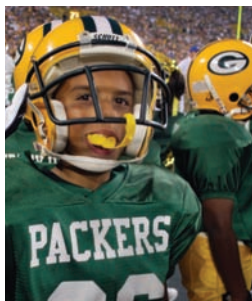
NFL FOOTBALL FIELD IN MITCHELL PARK