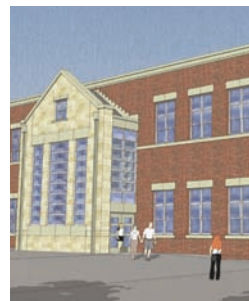
JOURNEY HOUSE LONGFELLOW CENTER FOR FAMILY LEARNING AND YOUTH ATHLETICS RENDERING