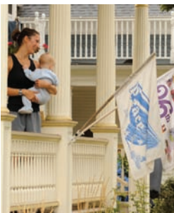
WELCOME TO CLARKE SQUARE