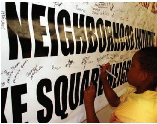
ADOPTING THE PLANS FOR CLARKE SQUARE