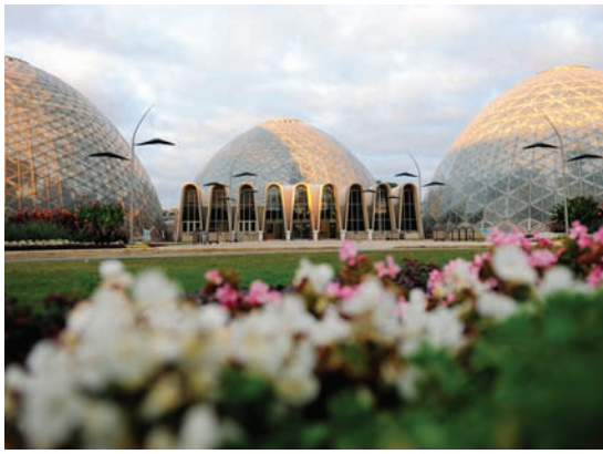
MITCHELL PARK DOMES