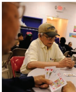
MILWAUKEE CHRISTIAN CENTER