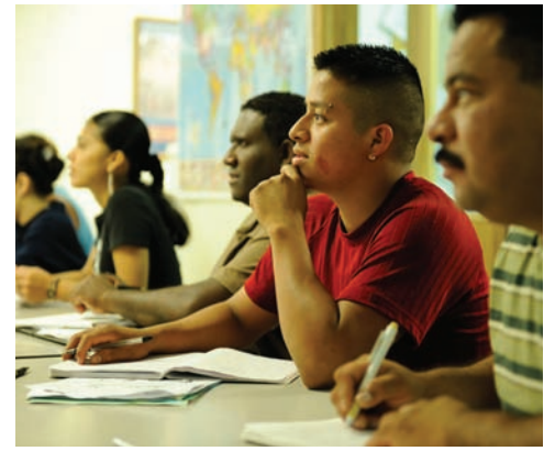
JOURNEY HOUSE ADULT EDUCATION PROGRAMS