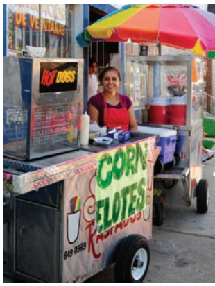
CART VENDORS ON CESAR CHAVEZ DRIVE