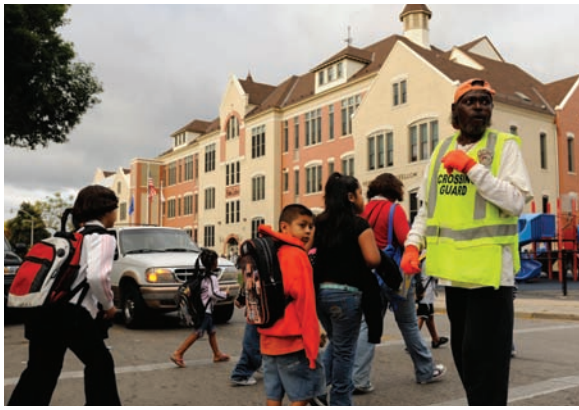
LONGFELLOW ELEMENTARY SCHOOL