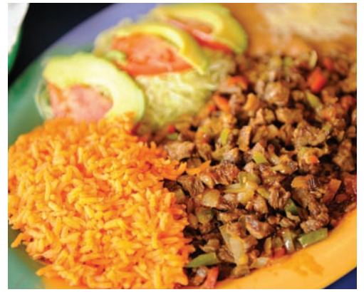
MEXICAN CUISINE AT CHAVEZ DRIVE RESTAURANT