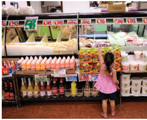
MERCADO EL REY SUPERMARKET