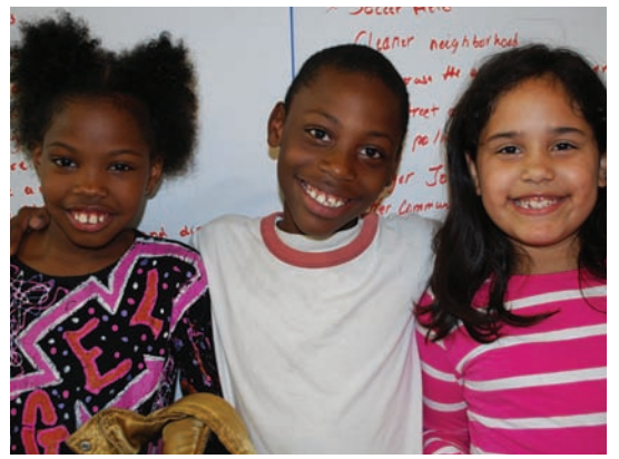
YOUTH PARTICIPANTS AT APRIL 30 ZNI CLARKE SQUARE VISIONING EVENT